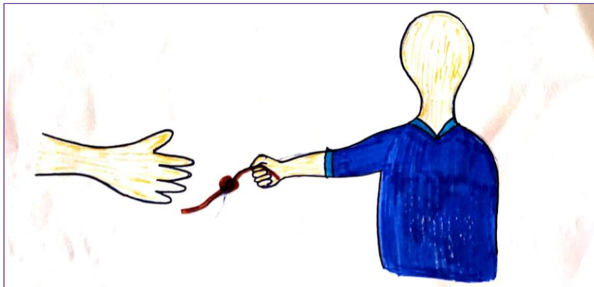
Fig 2- Students' perspective about professional values in patient-physician relationship in this picture: "I wanted to show my assistance and sympathy toward patients, so I drew a hand holding a rope tightly."