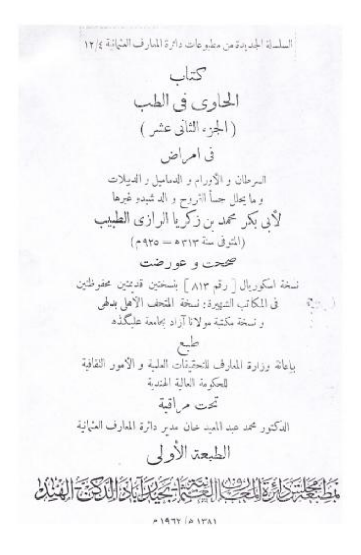
Figure 1. The front cover of Al-Hawi, Arabic manuscript, Vol.12

One of the most significant works on the description, diagnosis, differential diagnosis, prognosis and therapeutic approaches towards cancer is Alhawi by Rhazes (Figures 1 and 2), which was written prior to Avicenna's Cannon and al-Ahwazi's Kamil al-Sina'ah.